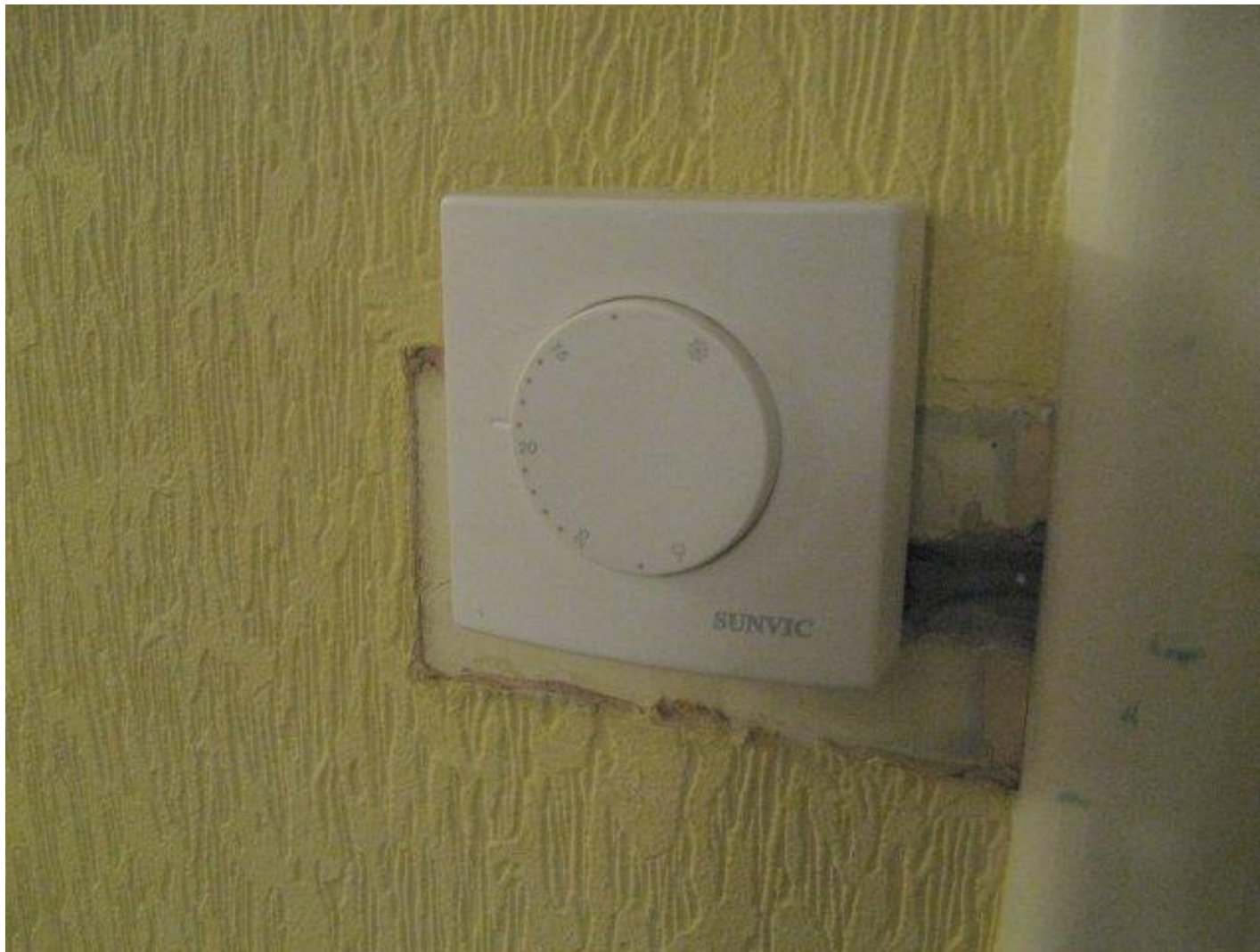
Figure 6 – A Heating Control - Question 40