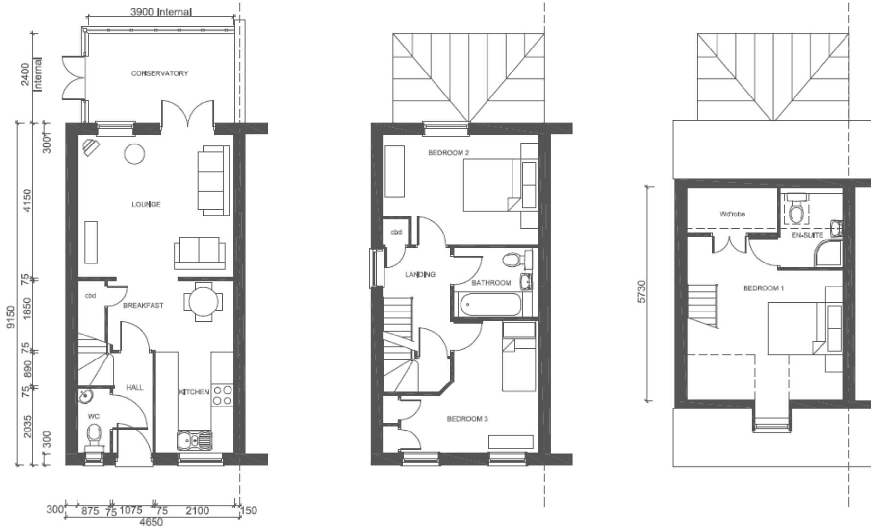
Figure 4 – Ground floor, first floor & second floor plans of a dwelling – Question 15