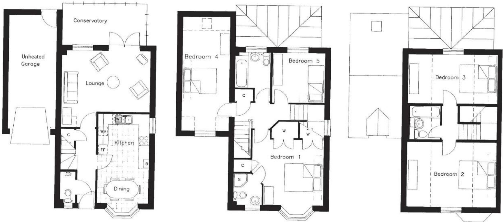
Figure 5 – Ground floor, first floor & second floor plans of a dwelling – Question 36