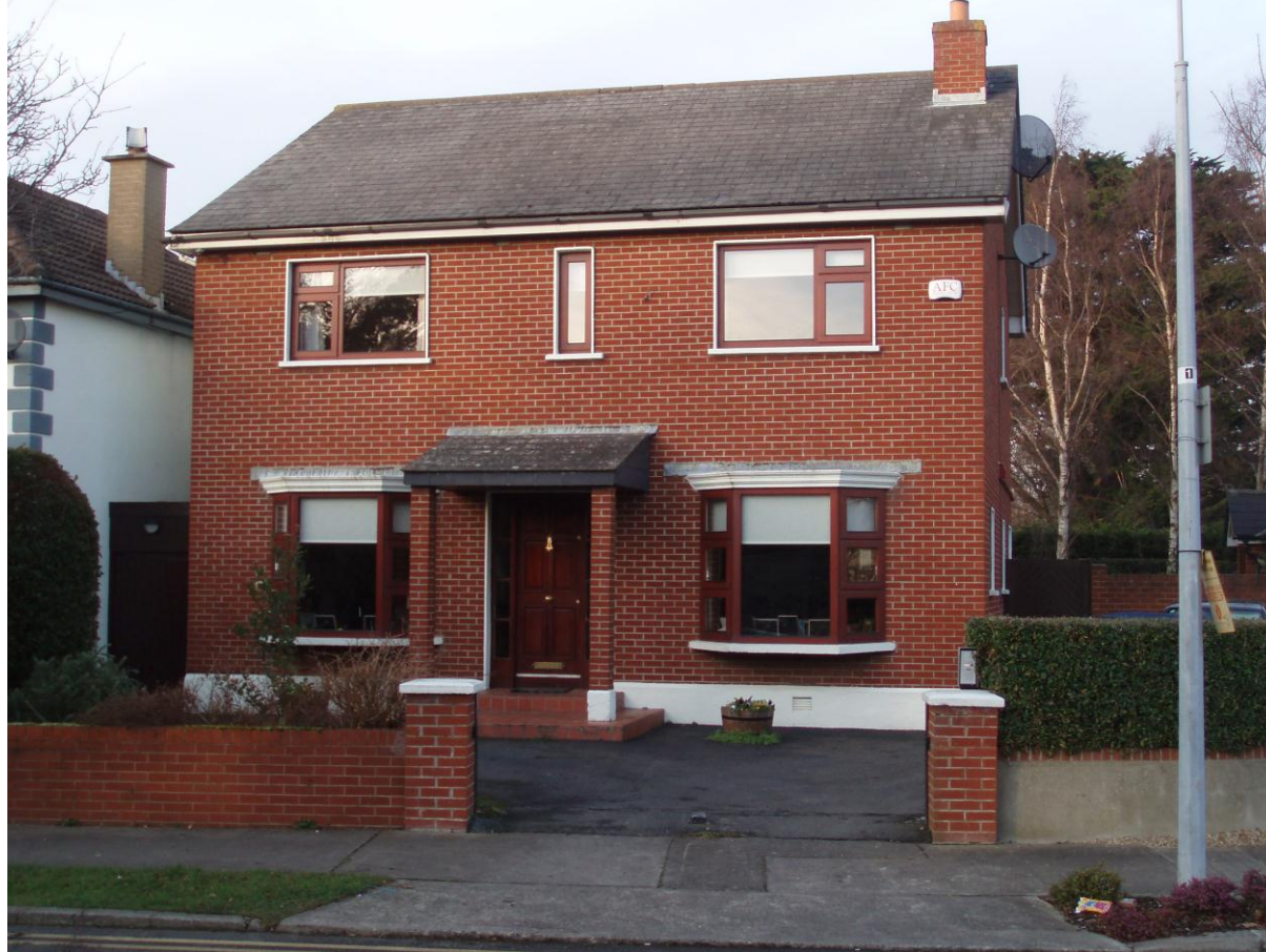
Figure 2 – Question 12