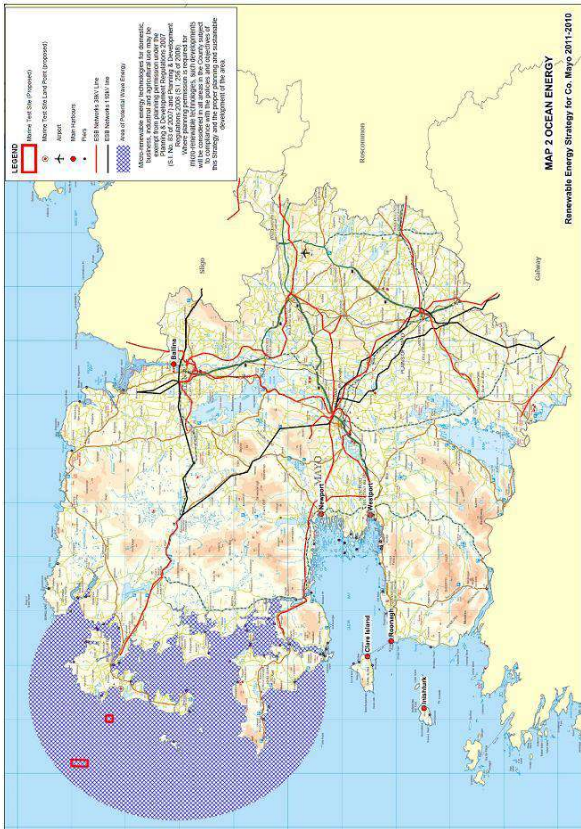
Figure 1-2: Mayo County Council Renewable Energy Strategy – Potential Wave Energy Map