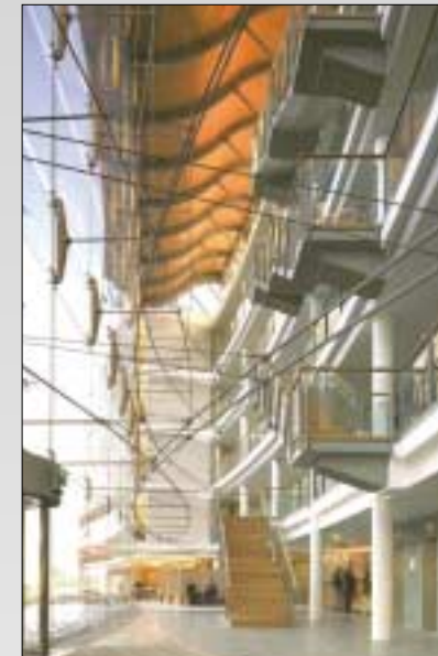
The Atrium section with large areas of glass requires careful consideration to avoid energy wastage.

The atrium contains a large curved glass wall, supported by a system of cables.