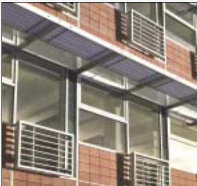
Various solar shading devices to keep out the summer sun while admitting winter heat.

These elements include an array of solar shading devices and light shelves each designed specifically to cater for the requirements of the particular glazing orientation, building self-shading and thermal loads.