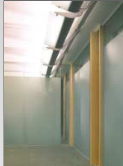
Subtle vertical vents in cellular offices attached to the atrium provide cross ventilation

In addition to the cross ventilation provided in the office areas, there is a stair well at the end of each office bar containing ventilation louvres at the upper section. With the stair well doors magnetically held open, the stairwell acts as a stack, supplementing the cross ventilation.