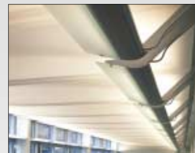
Curved, exposed concrete absorbs heat from the space, and distributes light evenly across the office.

The curved profile of the exposed ceiling slab rises from the centre of each office bar towards the windows and therefore allows a deeper, more even daylight penetration. The intrusion of edge beams was avoided by detailing up-stand beams concealed within the floor void above, maximising the area available at high level for daylight admission. The parabolic curve of the slab has been specifically designed in conjunction with the photometry of the up-lighters to ensure even light distribution across the working plane.