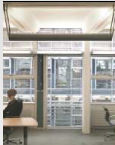
Typical open plan office area showing the vertical ventilators that allow the occupants to control their local environment.