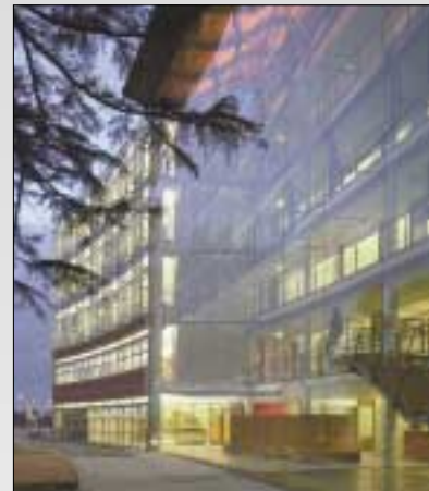
View of facade at dusk indicating building's transparency

The construction of this building and the delight of its staff with their new low energy office environment, will hopefully convince the most sceptical of office developers that it is possible to design comfortable modern office buildings in Ireland without a reliance on energy consuming air conditioning.