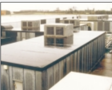
FIG 1. ROOF-MOUNTED AHUs

The plant facilities include 11 Air Handling Units (AHUs), each incorporating supply and return air fans. Eight AHUs are roof-mounted in weather-proof enclosures (Fig. 1) and arranged in pairs with