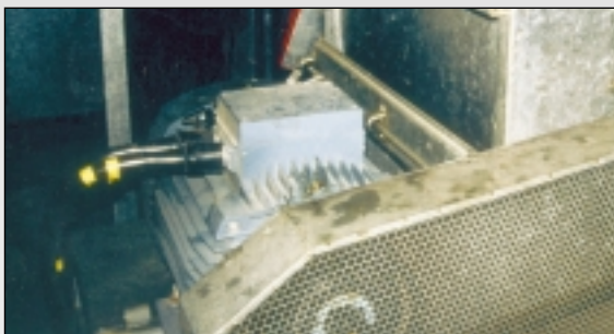
FIG 3. AHU#4 - Supply Fan and 55 kW Motor