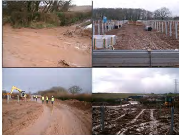
Figure 1 Construction Related Soil Impact

What mitigation measures are envisaged as being necessary to preclude silt laden run off from the site (as illustrated by examples figure 1 below)