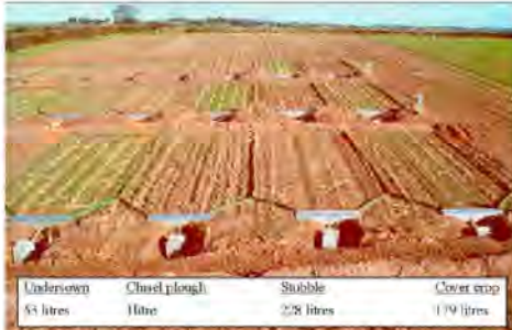
Figure 2. Ploughing & Run Off Experiment

Research presented to the British Hydrological Society in 2014 indicated that chisel ploughing the site on construction would be the most effective means for reducing run off volumes 3 . The research was undertaken by the United Kingdom Environment Agency. The run off volumes outlined below were calculated on the basis of 25mm of rain in 24 hours on a plot size of 10 x 4.5m. Should this method of land management be utilised in order to facilitate the enhancement of the retention of rainfall within a proposed site?