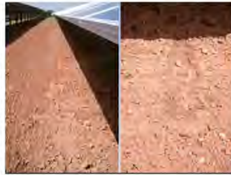
Figure 3 Kinetic Compaction & Rivulets

Unlike the rainfall pattern in many other countries, especially in the tropics, average hourly rainfall amounts in Ireland are quite low, ranging from 1 to 2mm. Short-term rates can of course be much higher: for example, an hourly total of 10mm is not uncommon and totals of 15 to 20mm in an hour may be expected to occur once in 5 years. Precise rainfall returns on a site specific basis can be acquired from Met Éireann. Some research has been undertaken into the effects of run off from solar arrays to ground. Kinetic compaction and the formation of rivulets in the soil beneath solar arrays. Figure 3, right, illustrates this phenomenon.