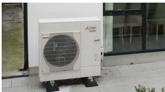
Figure 2: Air Source Heat Pump Outdoor Unit

Ground Source and Water Source: Ground source and water source heat pump systems are less common than air source units. A ground source heat pump system, also known as a geothermal heat pump system, uses the earth as a source of renewable heat. Heat is drawn from the ground through collector pipework and transferred to the heat pump. The ground collector can be laid out horizontally at a shallow depth below the surface or else vertically to a greater depth.