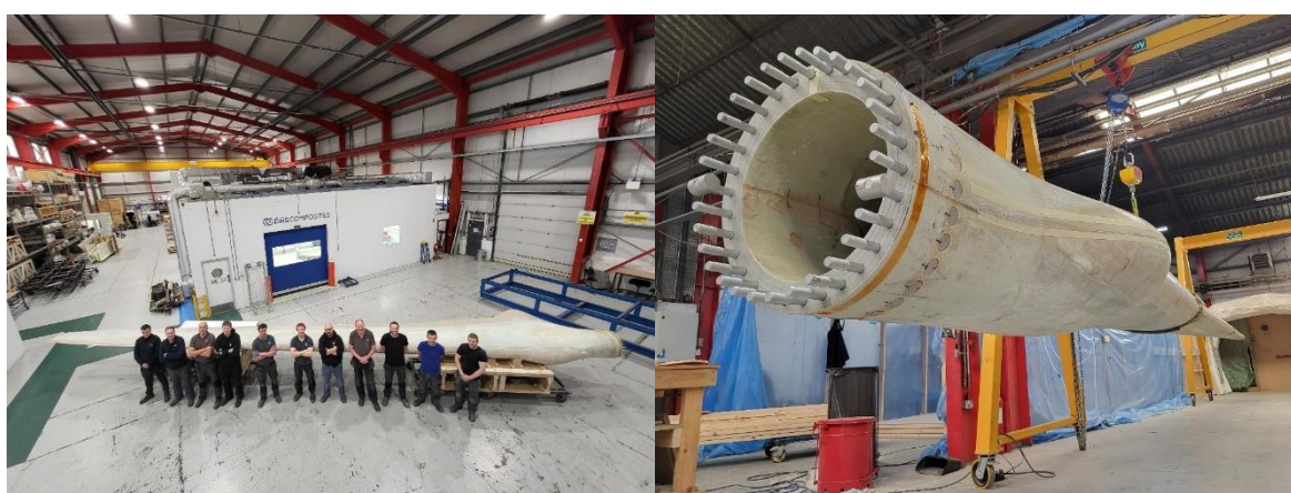
Figure 2: Completed 13 m wind blade (left) with T-bolts installed (right)