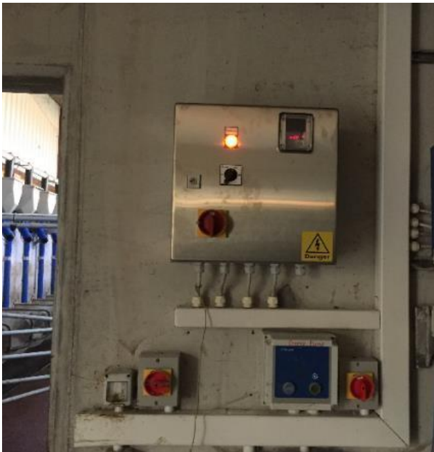
Example B2: Photo of new milk pump inverter (same application as B1):