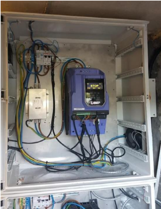
Example C1: photo of new VSD in cabinet