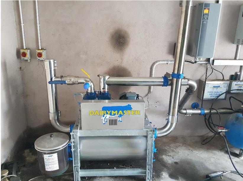
Example A2: Photo of new vacuum pump (same application as A1):