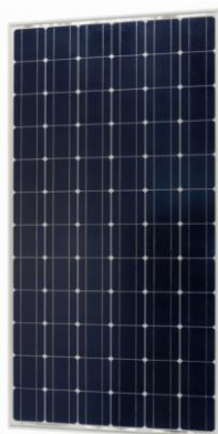
Figure 2: PV Module