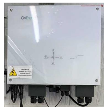
Figure 5: Battery