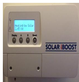
Figure 4: Diverter