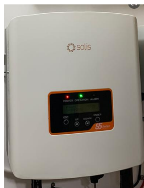
Figure 3: Inverter