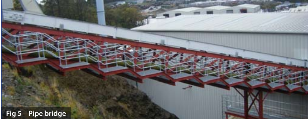
Fig 5 – Pipe bridge