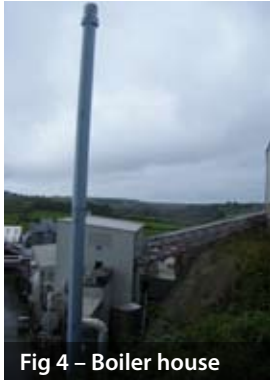
Fig 4 – Boiler house