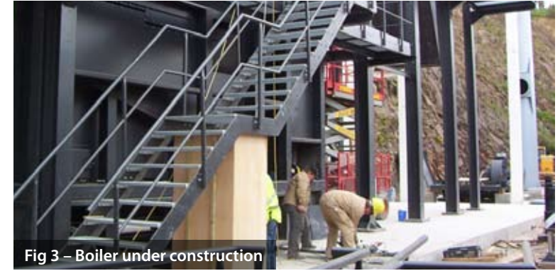
Fig 3 – Boiler under construction