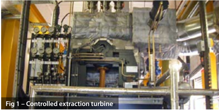
Fig 1 – Controlled extraction turbine