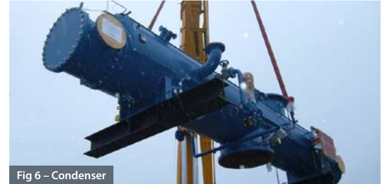
Fig 6 – Condenser