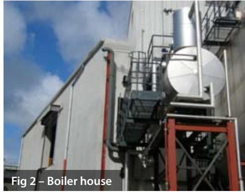
Fig 2 – Boiler house